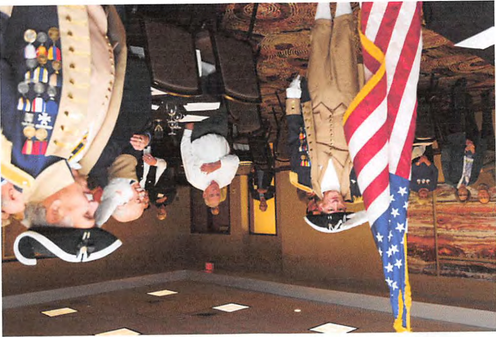
Next Meeting: January 14th, 2019 at Embassy Suites in St Charles