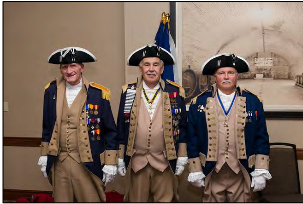
Color Guard presenting the Colors.