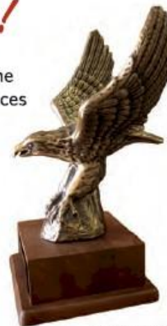
State Winner Trophy

LIST OF STATE CHAIRS, ANCESTRY CHARTS, COMPLETE RULES AND ALL FORMS CAN BE FOUND AT WWW.SAR.ORG