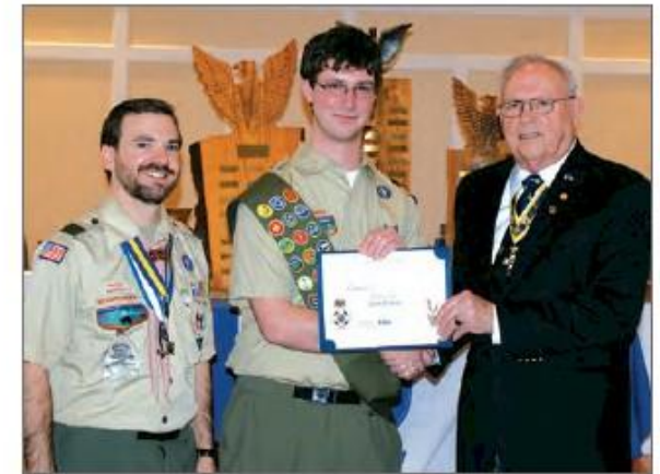
Eagle Scout Court of Honor recognition by the Sons of the American Revolution.

The SAR and the Boy Scouts participate in many activities together. Scouts of all ages can help during SAR parades and ceremonies including grave markings and Revolutionary War battle ceremonies. SAR members contribute to Scouting activities by teaching relevant merit badges, such as American Heritage, Genealogy, Law, Citizenship in the Community, Citizenship in the Nation, and Citizenship in the World.