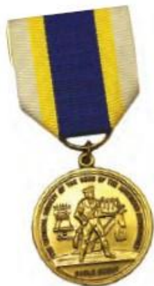
Chapter Winner Medal

Original patriotic theme of not more than 500 words