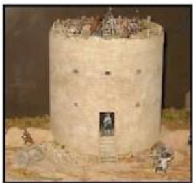
A diorama of Fort San Carlos in the Missouri Capital.

While membership in the SAR is for adults 18 years or older, eligible youth may join the Children of the American Revolution.