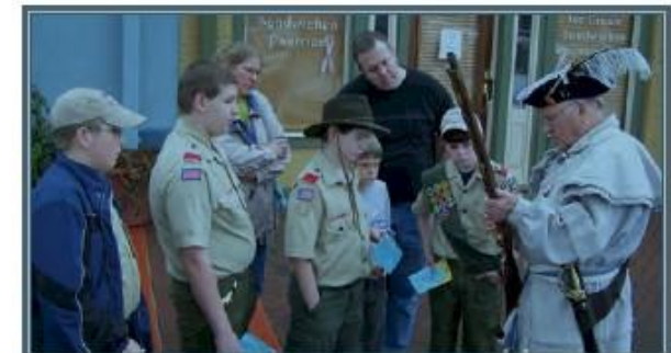
Scouts observing musket demonstration during Washington, Georgia, ceremonies.

The SAR and the Boy Scouts participate in many activities together. Scouts of all ages can help during SAR parades and ceremonies including grave markings and Revolutionary War battle ceremonies. SAR members contribute to Scouting activities by teaching relevant merit badges, such as American Heritage, Genealogy, Law, Citizenship in the Community, Citizenship in the Nation, and Citizenship in the World.