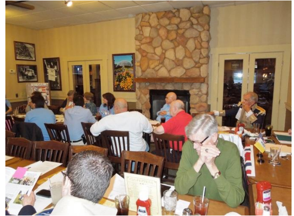
Attendees at the Chapter meeting – Compatriots, Spouses and guests.