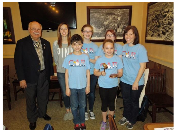
Presentation of a gavel and block to the Nathan Futrell Society C.A.R.