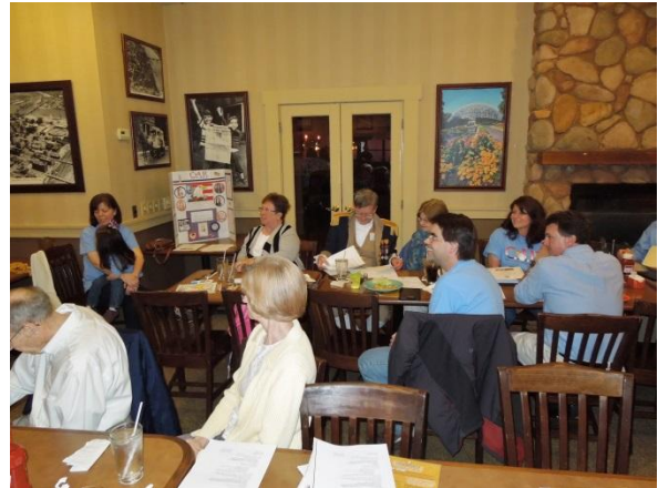
Attendees at the Chapter meeting – Compatriots, Spouses and guests.