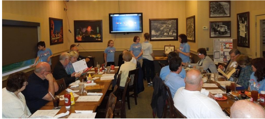
Program presentation by the Nathan Futrell Society C.A.R.